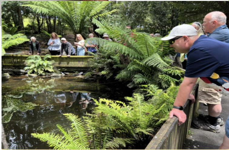
Right some club members looking into one of the many ponds there.